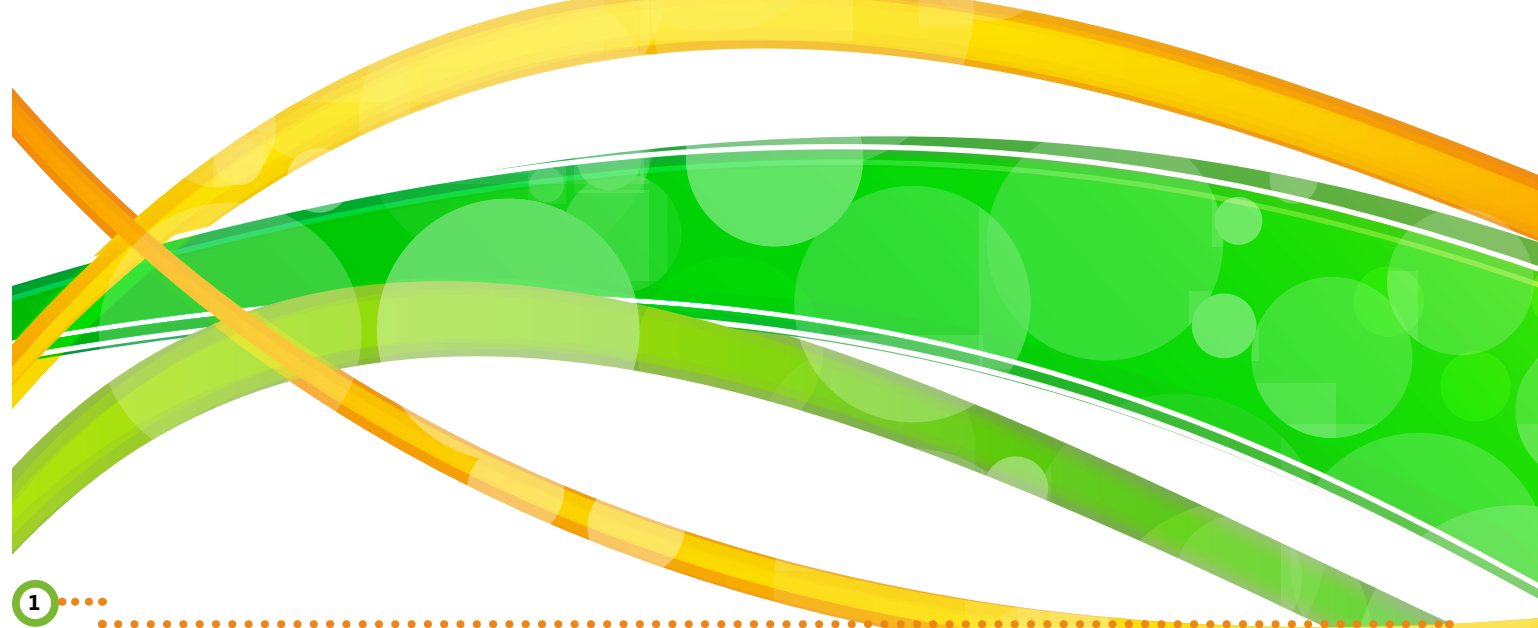
EMPOWER THE FUTURE